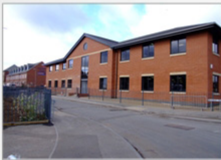
Three Valleys House

Bramley Road, Long Eaton, Derbyshire, NG10 3SX